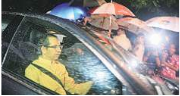
Uddhav Thackeray after submitting his resignation on Wednesday.

His resignation as CM and MLC, which he announced in a Facebook address to the public, brought to an end the 31-month-old rule of the MVA and set the stage for the return of a