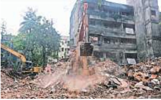
Debris being cleared at the building collapse site on Wednesday. Ganesh Shirsekar

Contractor Dilip Vishwas, who had put up daily wage labourers on rent in the building, was also arrested on