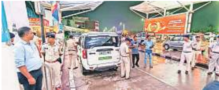
Outside the Goa airport on Wednesday night.

Shinde and the other rebel MLAs reached the Taj Resort and Convention Centre in Dona Paula, where they were scheduled to spend the night, around