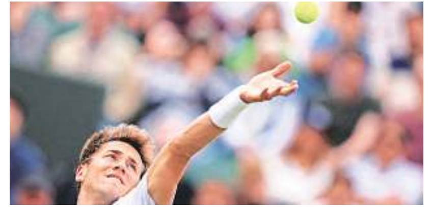
Third seed Casper Ruud lost to Ugo Humbert 3-6, 6-2, 7-5, 6-4.

Key Results : Second Round : Men's Singles: 1- Novak Djokovic (Serbia) bt Thanasi Kokkinakis (Australia) 6-1, 6-4, 6-2; Ugo Humbert (France) bt 3-Casper Ruud (Norway) 3-6, 6-2, 7-5, 6-4; David Goffin (Spain) bt 31-Sebastain Baez (Argentina) 6-1, 6-1, 6-4; Women's Singles: Juke Niemeier (Germany) bt 2-Anett Kontaveit (Estonia) 6-4, 6-0; Greet Minnen (Belgium) bt 9-Garbiñe Muguruza; 15-Angelique Kerber (Germany) bt Magda Linette (Poland) 6-3, 6-3.