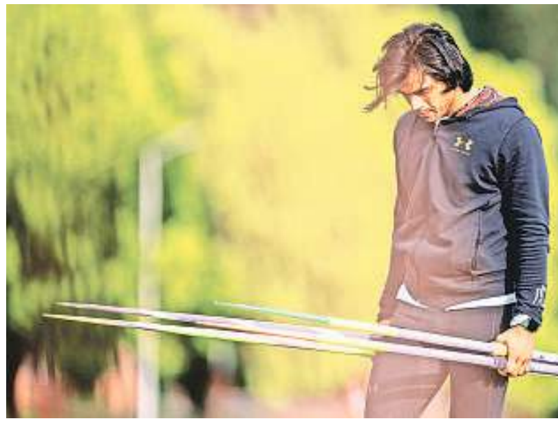
Neeraj Chopra will aim for consistency in the Diamond League cycle held at four venues before the final at Zurich.

On Thursday night, the Diamond League in Stockholm is where Chopra's quest to make the cut for this year's final in Zurich begins. At the Olympic Stadium in the Swedish capital he also gets an opportunity to tick a box. He has never won a Diamond League competi-