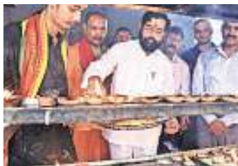
Eknath Shinde offers prayers at Kamakhya temple in Guwahati on Wednesday.

11.15 pm amid heavy security cover. Sources said at least 80 rooms were booked for the Shinde camp.