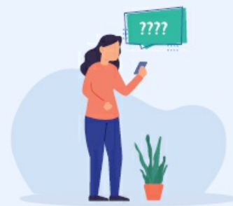
Speech and writing changes