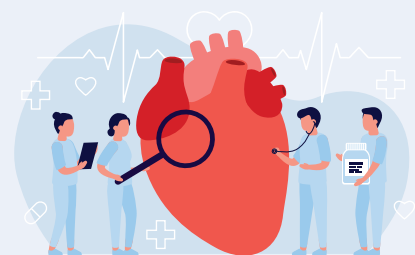
Heart Related Issues