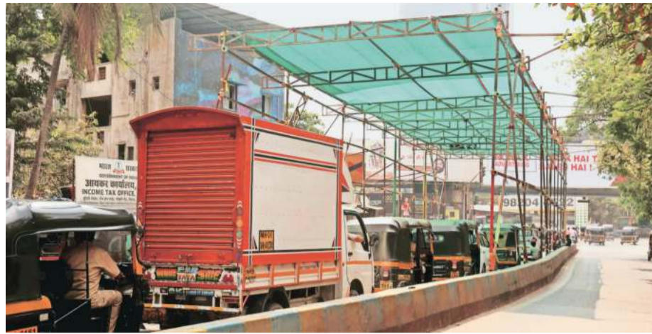
A shade has been erected on Gokhale Road on an experimental basis to provide relief to commuters while waiting at the signal. Deepak Joshi

Tankers continue to be a key source of water in the city, especially in informal settlements.