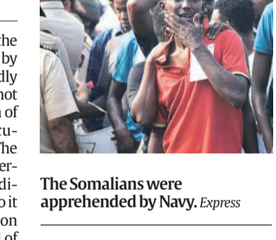
The Somalis were apprehended by Navy. Express

Thirty-five Somali men were arrested on March 23 by the police after they were apprehended by the Indian Navy during an anti-piracy operation. They are alleged to have hijacked a cargo ship from Bulgaria, MV