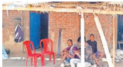
Initially, the villagers suspected a 'pandemic' outbreak. Express

SP Keni Bagra said after the three arrived at the hotel in Ziro, hotel staff continued to see them moving around the premises until March 31. ENS