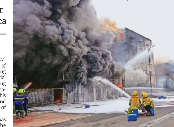
The fire was reported around 11 am on Tuesday inside Navbharat chemical industry.