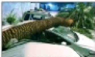
Tree trunk lying on the ground, likely a result of a storm.

New Delhi: A severe weather system hit northern India, causing heavy rain and lightning. At least 39 people were killed across three states, and two died in the capital. Road, rail, and air traffic were also affected.