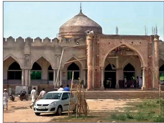
The mosque in Uttawa village, Haryana

NIA, TOI has learnt, is examining if other Indians visiting or working in Dubai or UAE were in touch with Pakistani nationals there who may be acting as conduits for FIF terror funds being pumped into India for allegedly carrying out terrorist activities. Moham-