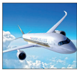
Lack of opportunities is one of the factors that draws Indian pilots overseas

"There were four pilots operating the inaugural Newark-Singapore flight. Of the four, three are Singaporeans and one is Malaysian.