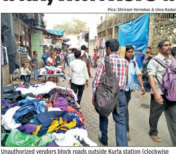
Unauthorized vendors block roads outside Kurla station (clockwise from above), Dadar (E) station and Santacruz station

Civic officials, however, insist that they are focusing on ensuring that there is no haw-