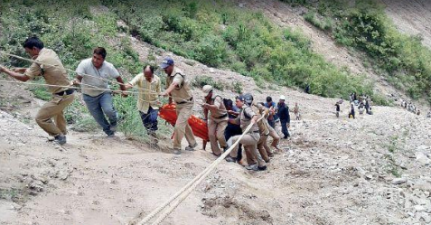
Rescuers haul up an injured passenger after an Uttarakhand state-run bus plunged into a 250-metre-deep gorge around 8am on Thursday. The bus which was carrying 31 passengers and was headed for Haridwar, met with the accident on Rishikesh-Gangotri NH-108, 15km from Chamba (Telvri district).

While 14 people died in the accident, 17 were injured. 14 of the injured are critical.